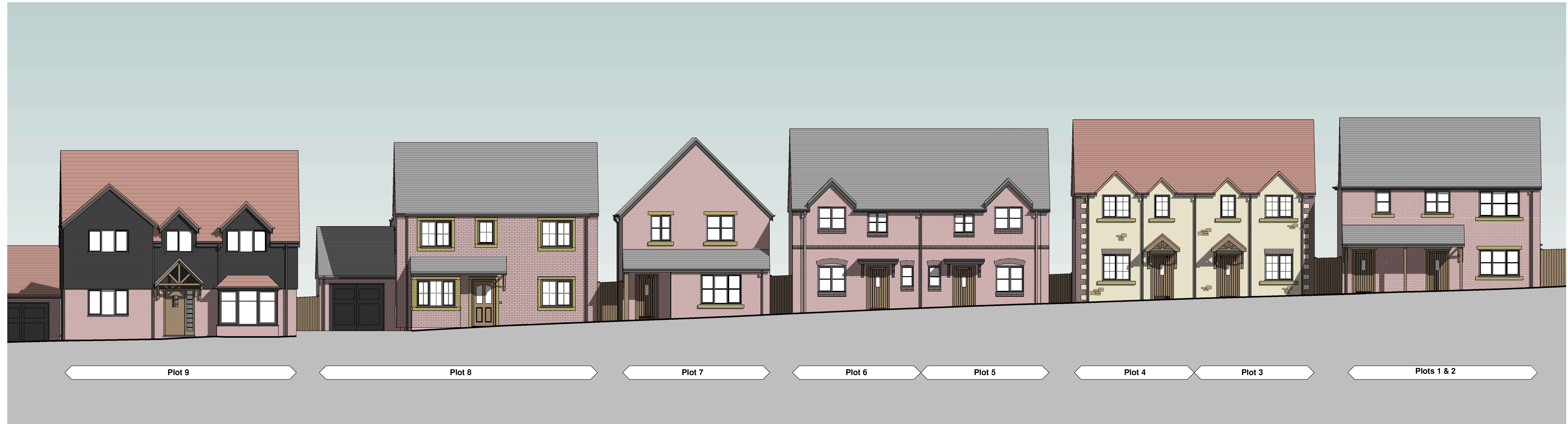
PROPOSED PLOTS 1-9 STREET SCENE