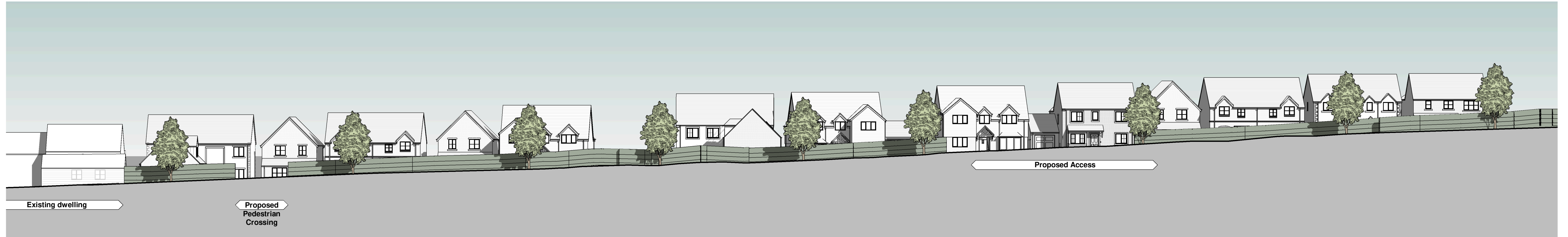
ODELL ROAD FRONTAGE

This drawing remains the property of Welland Design and Build Ltd and may not be reproduced or amended except by written permission. No liability will be accepted for any amendments made by others. The Contractor is responsible for checking all site dimensions, site levels, sewer inverts at connection points before commencing any works. All work by the contractor must comply with all current relevant legislation, regulation standards guidance and law whether or not specified on this drawing. The contractor is responsible for checking this drawing against all other relevant architect and engineers details and drawings prior to commencement of site works.